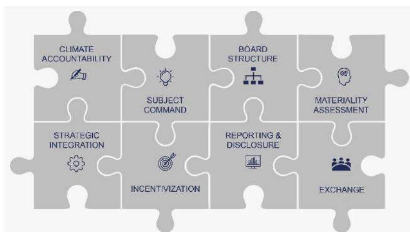
Figure 1: Guiding principles for effective climate governance on corporate boards

However, despite this growing awareness of the scale and urgency of the climate crisis, few directors possess the specific interdisciplinary skills necessary to effect this wholesale change of culture and behaviour. It is for this very reason that the Climate Governance Initiative (CGI) came into being: in 2019, the World Economic Forum unveiled the Principles for Effective Climate Governance , a comprehensive set of guidance principles that lay out best practice for boards and their directors in respect of the climate. To facilitate their promotion and implementation, local CGI “Chapters” have been set up around the world to serve as centres of expertise and venues for directors to exchange with each other as well as with a wide range of subject matter experts.