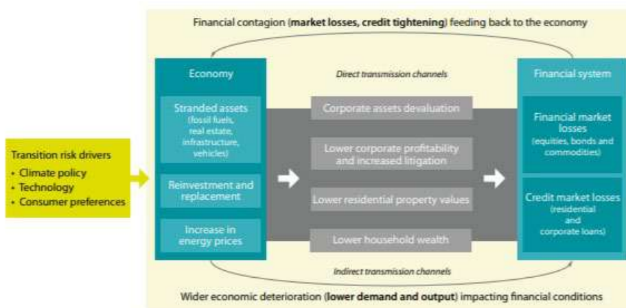
Figure 2: Climate-related systemic risks arising from transition risks. Source: NGFS Guide for Supervisors: Integrating climate-related and environmental risks into prudential supervision (2020) p. 13.

As businesses become visibly disrupted from the impacts of a changing climate and the transition to a net-zero emissions economy, the awareness of these financial and systemic risks has become squarely mainstream. In